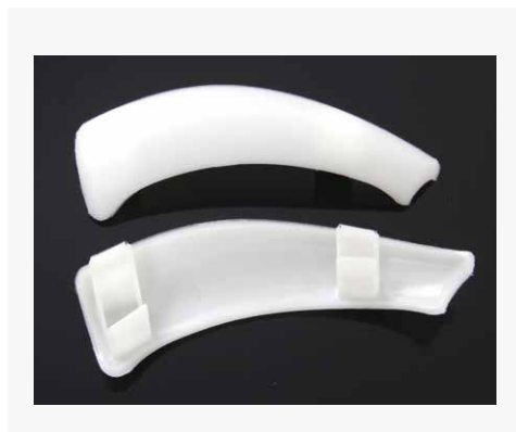
PHOTO LUMINESCENT VENT COVERS