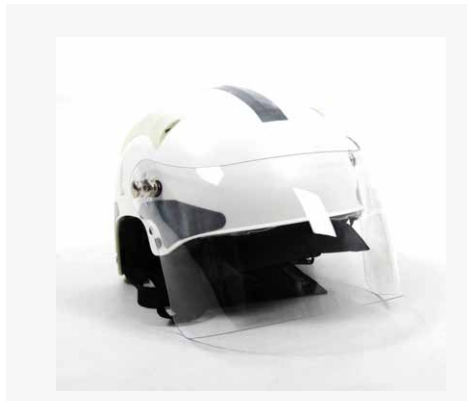
HALF MARINE VISOR