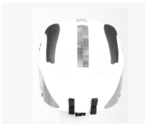
BLACK VENT COVERS