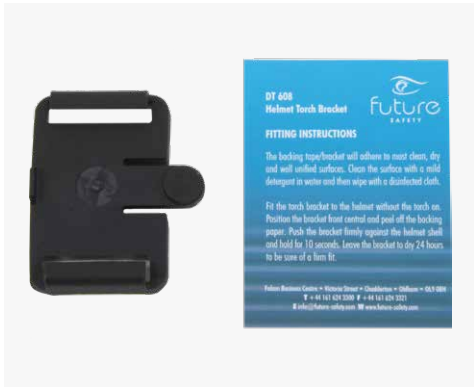
HELMET TORCH BRACKET