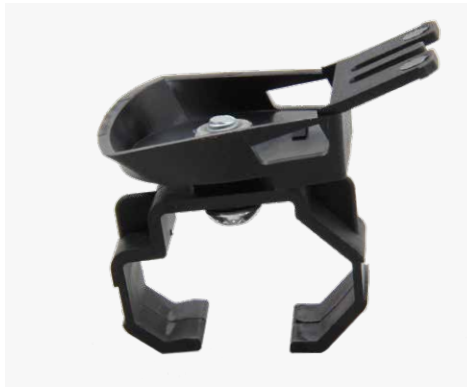
CLIP TORCH MOUNT