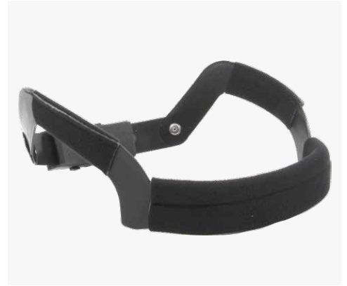
SUPERIOR DELUXE HARNESS