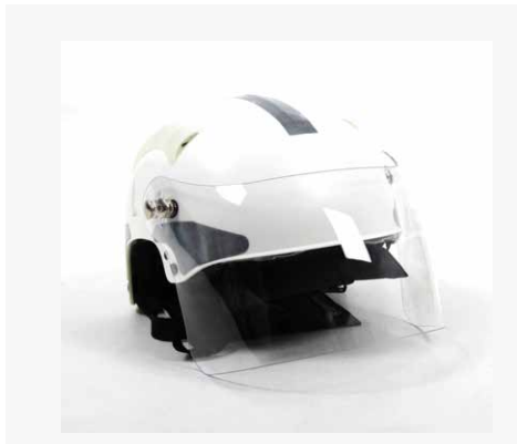
HALF MARINE VISOR