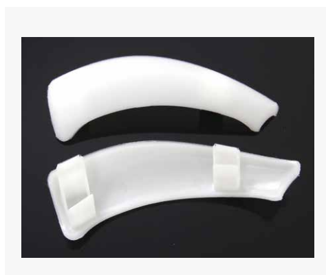
PHOTO LUMINESCENT VENT COVERS