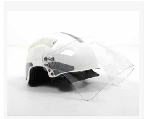
FULL MARINE VISOR