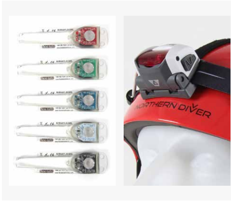
FLEXI LIGHT + GLARE HEAD TORCH