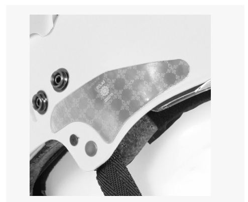
HIGH VIS SOLAS REFLECTIVE TAPE