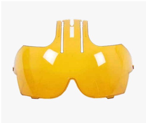
INTEGRAL VISOR Available in amber & clear